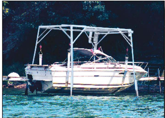
Overhead Lift with Adjustable Slings